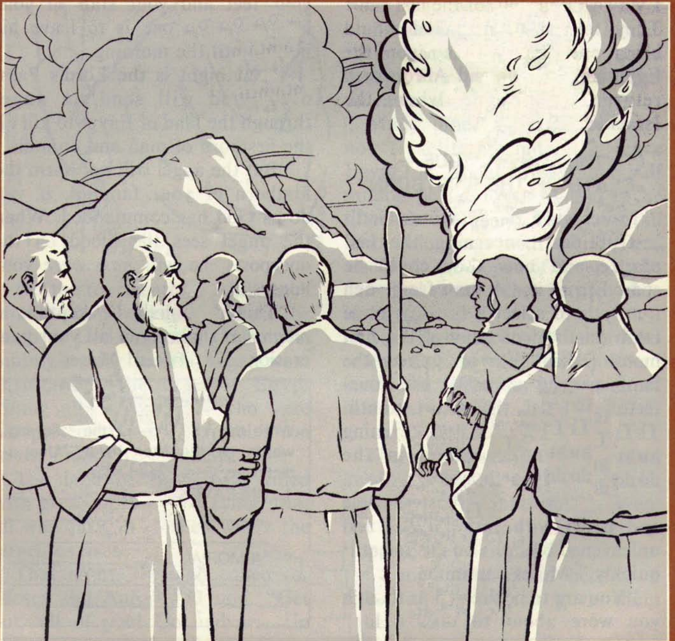
Israel's Deliverance from Egypt