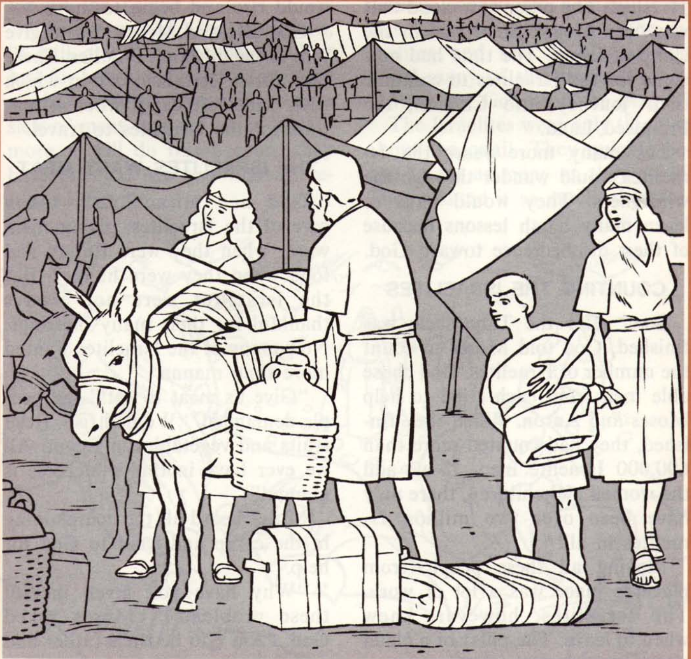
Forty Years in the Wilderness