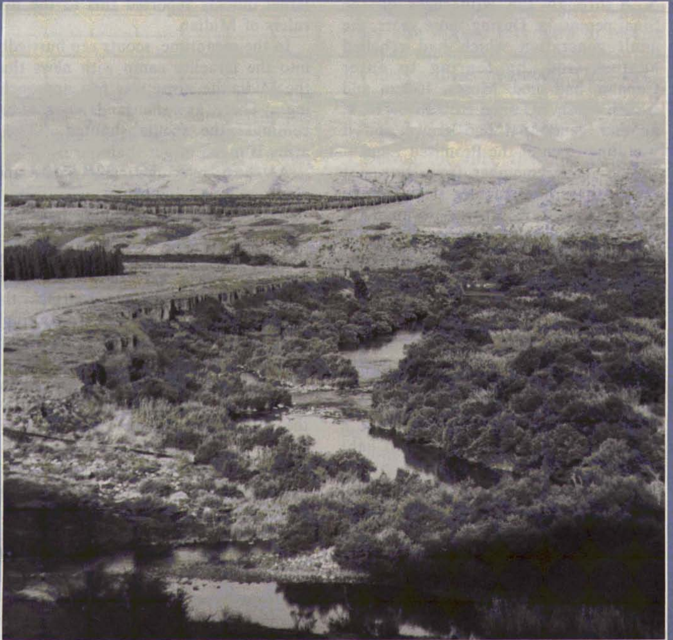
Israel Enters the Promised Land