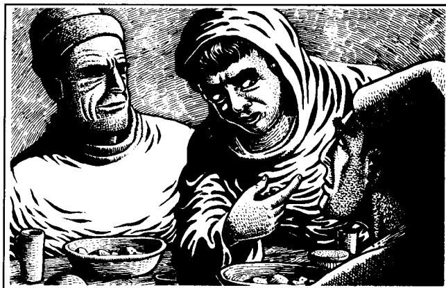
Rahab informed the two spies that soldiers had come to arrest them.

Before the Israelites entered Canaan, Joshua sent two spies across the Jordan River to the city of Jericho. Jericho was a major city along one of the trade roads through Canaan. The spies, dressed as Canaanite travelers, walked through the large gateway and into the city. As they