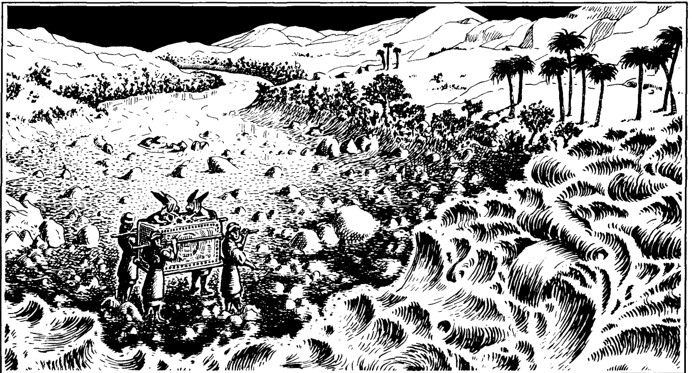
God held back the water of the Jordan River when the priests stepped into the water.

The next morning, Joshua rose early to prepare the army of Israel to march on Jericho. God had given very specific instructions as to what Israel was to do. According to God’s instructions, all the mighty men of Israel were to march