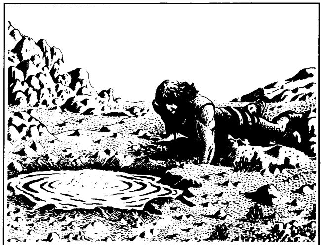
God caused a spring of cool, clear water to bubble up, thus saving Samson's life.

But Samson outfoxed them by leaving the inn at midnight. When he reached the main gates of the city, he discovered they were locked and barred.