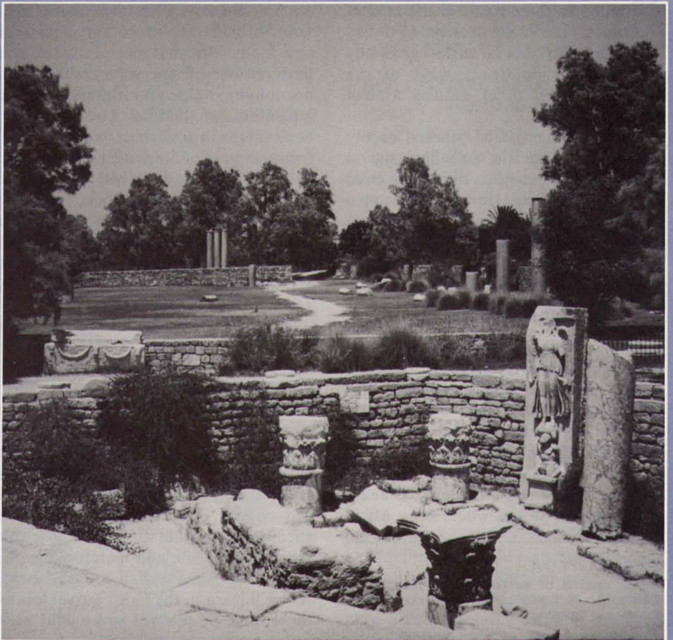
Israel During the Time of the Judges