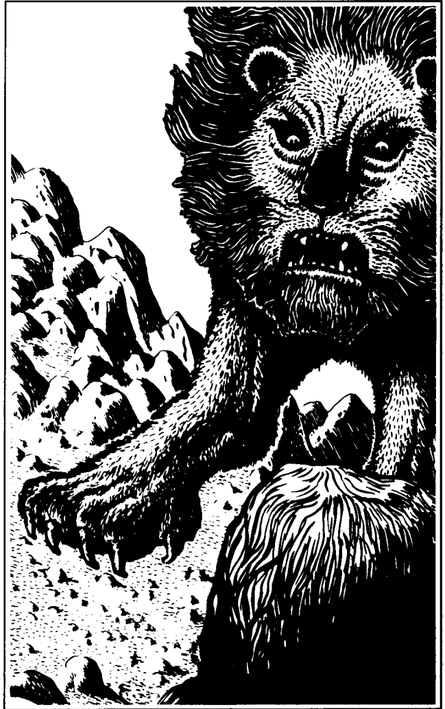
Samson quickly killed the fierce lion with his bare hands!

liked Philistine women. One day he met a young lady he wanted to marry. His parents were greatly upset by this, but Samson insisted on the marriage (Judges 14:1-4).