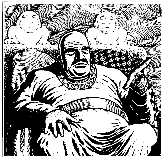
King Eglon demanded that Ehad tell him the secret message.

Ehad quietly left the room, locking the door behind him. By the time Eglon's body was discovered, Ehad had