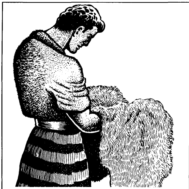
Gideon holds the fleece that proved God had chosen him to lead Israel against the Midianites.

But Gideon wanted another sign. “I will lay the fleece out again tonight,”