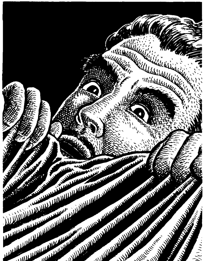
Boaz awakened after midnight to feel something pressing against his feet!