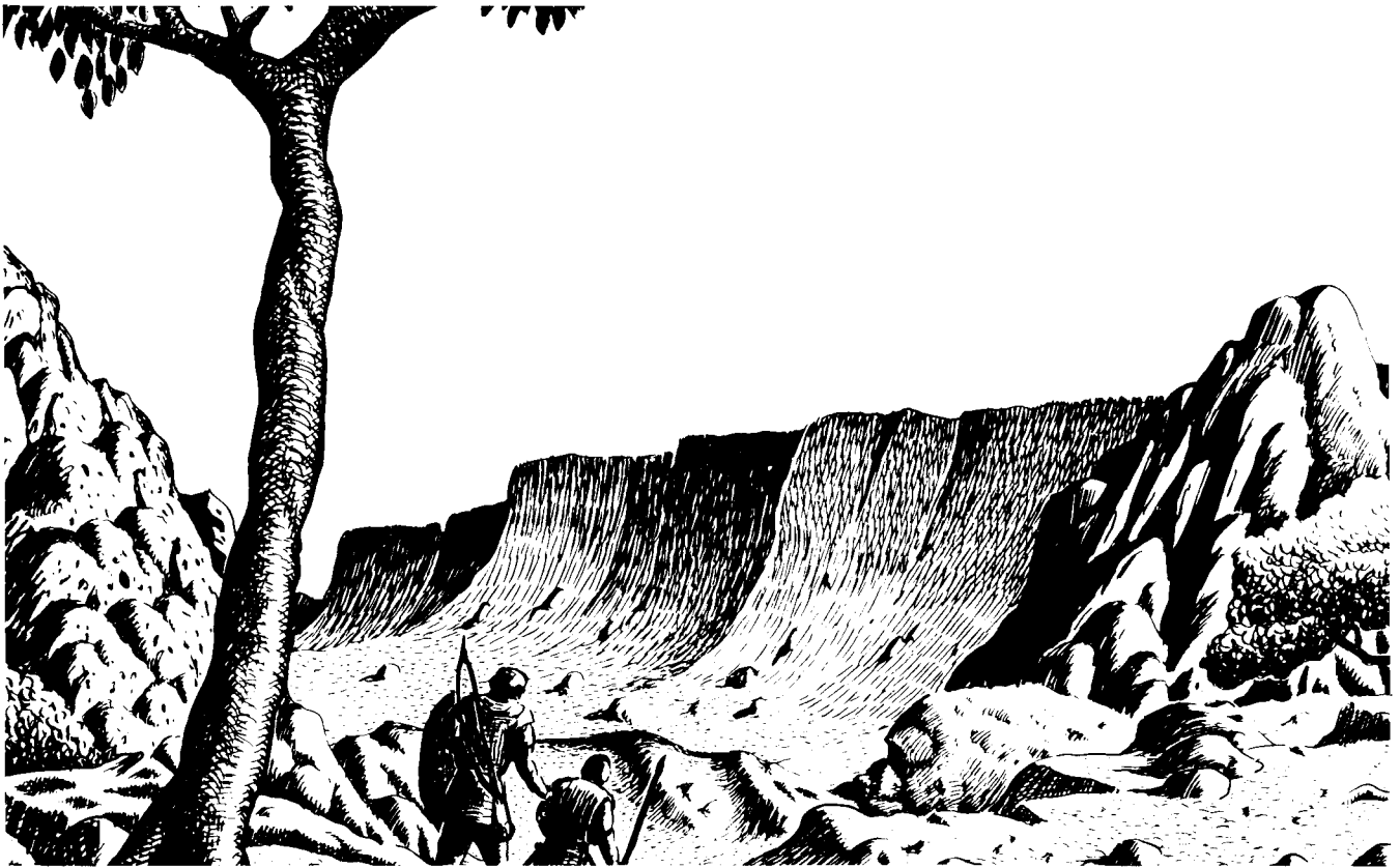
Jonathan and his armorbearer went boldly down into the valley, trusting God to defeat the Philistines.

God did not need a huge army to defeat the Philistines.