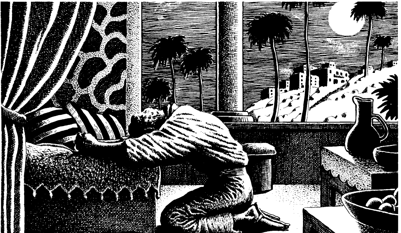
Whenever Samuel needed help, he prayed to God and asked what to do.

So Samuel told them everything. He told them what a king would do: take their sons to fight in his army, their daughters to be his servants and cooks; take their fields and vineyards, their sheep and cattle. Whatever the king wanted, he would take from them (I Sam. 8:11-18).