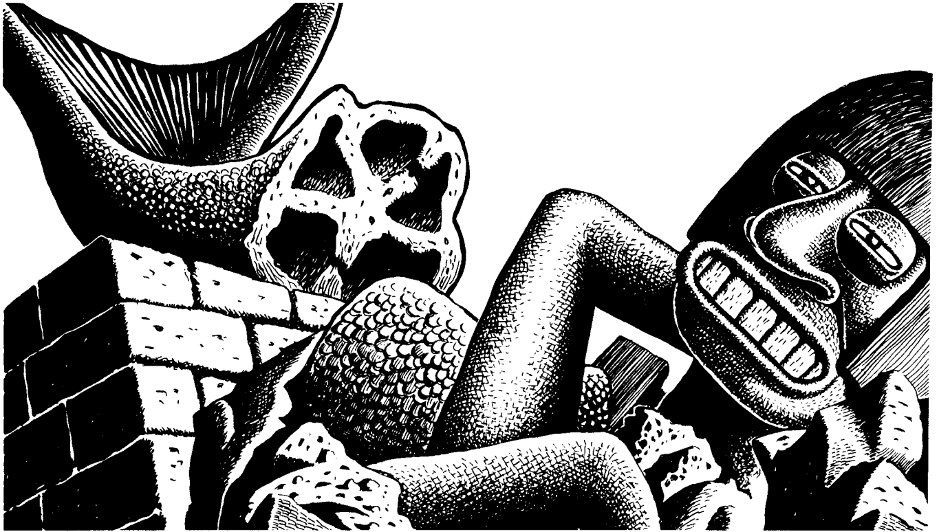
The Priests of the temple of Dagon were shocked to find their idol had fallen toward the ark, and the arms and head were broken off.