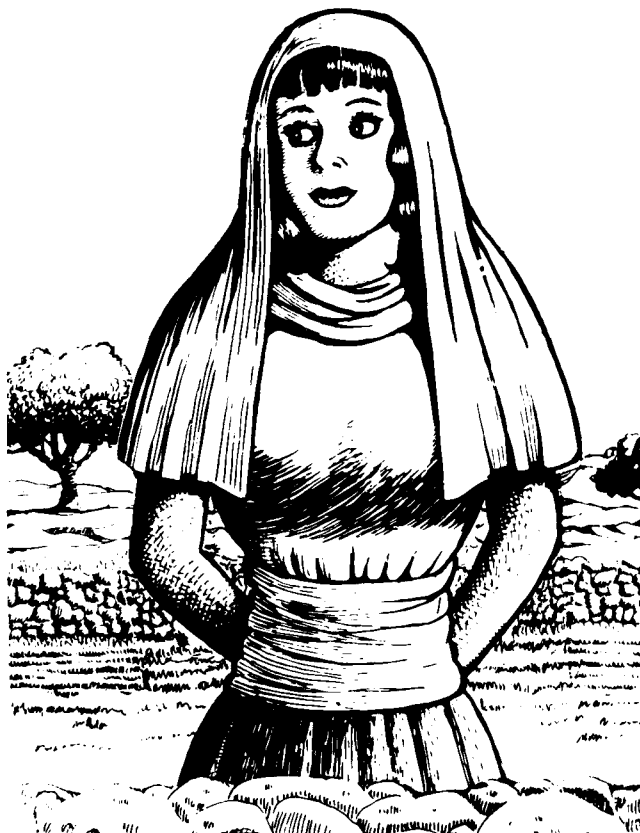
Ruth set a good example with her hard work.

Ruth set a good example that we can all follow: work hard with all your might and you will be blessed. Ruth was given a raise by Boaz. She didn’t know it, but the extra grain or corn was a bonus for her hard work.