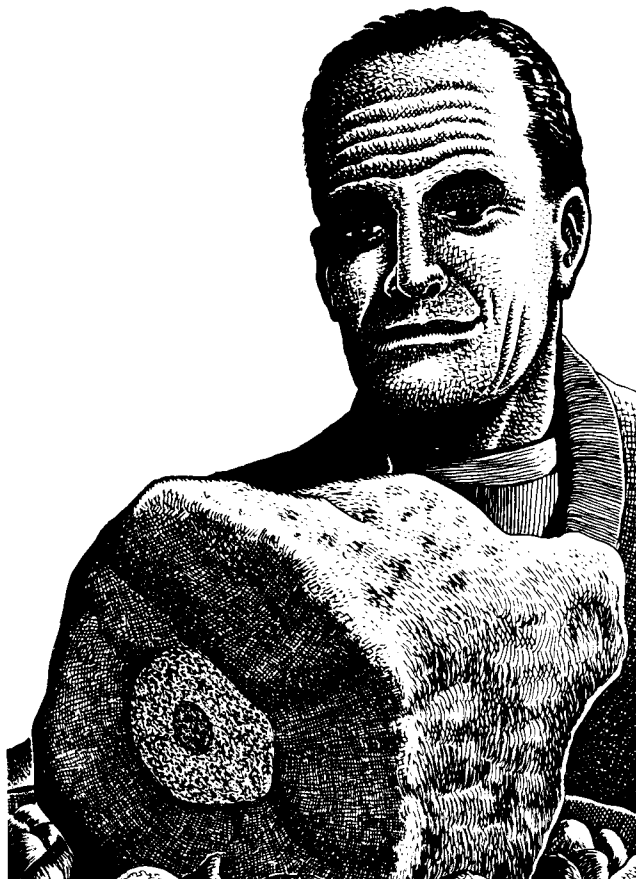
Saul was placed at the head of the table as God’s newly appointed king of Israel.

received God’s Spirit, Samuel called all of the people together. When lots were cast for all the people, Saul’s name was taken. This was God’s way of showing Israel whom He had chosen as king.