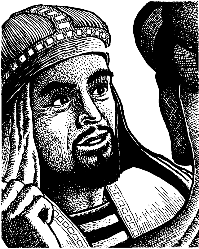
Boaz instructed the harvesters to leave a little extra grain for Ruth to gather.

In fact, Boaz was so pleased he told Ruth: "Don't go to any other fields to glean. You are always welcome here."