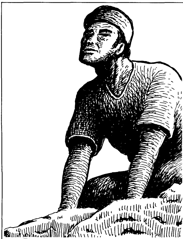
Elijah's servant watched intently from the top of Mt. Carmel for any sign of rain.