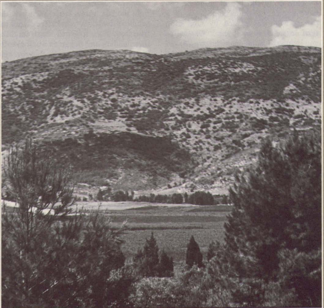
Elijah—A Man of Miracles