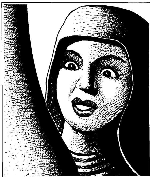
Because the widow helped Elijah, God blessed her with enough food to last throughout the drought.

From that day until the drought ended, she never had to worry about food. She fed Elijah, her son and herself for many days (I Kings 17:15).