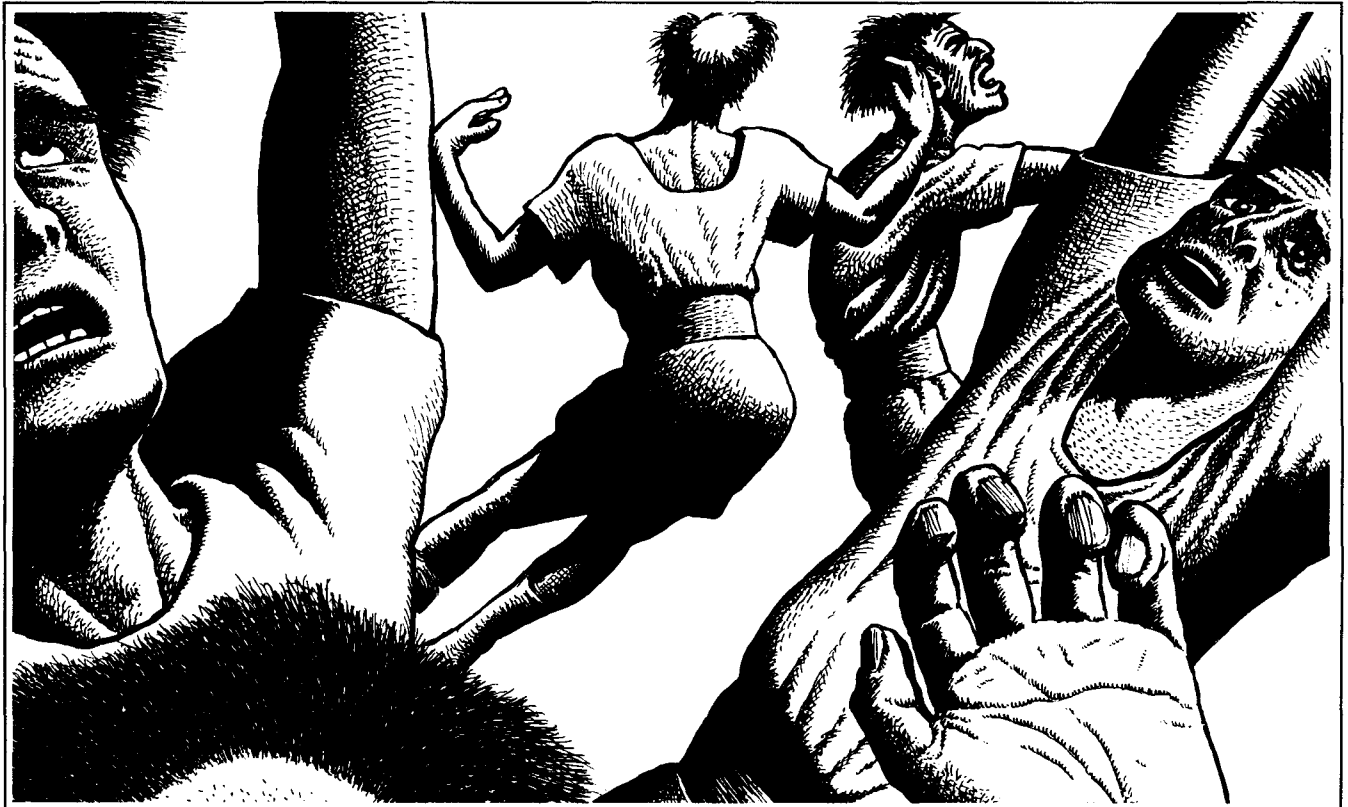
The prophets of Baal danced and sang wildly for hours, hoping their god would answer with fire.