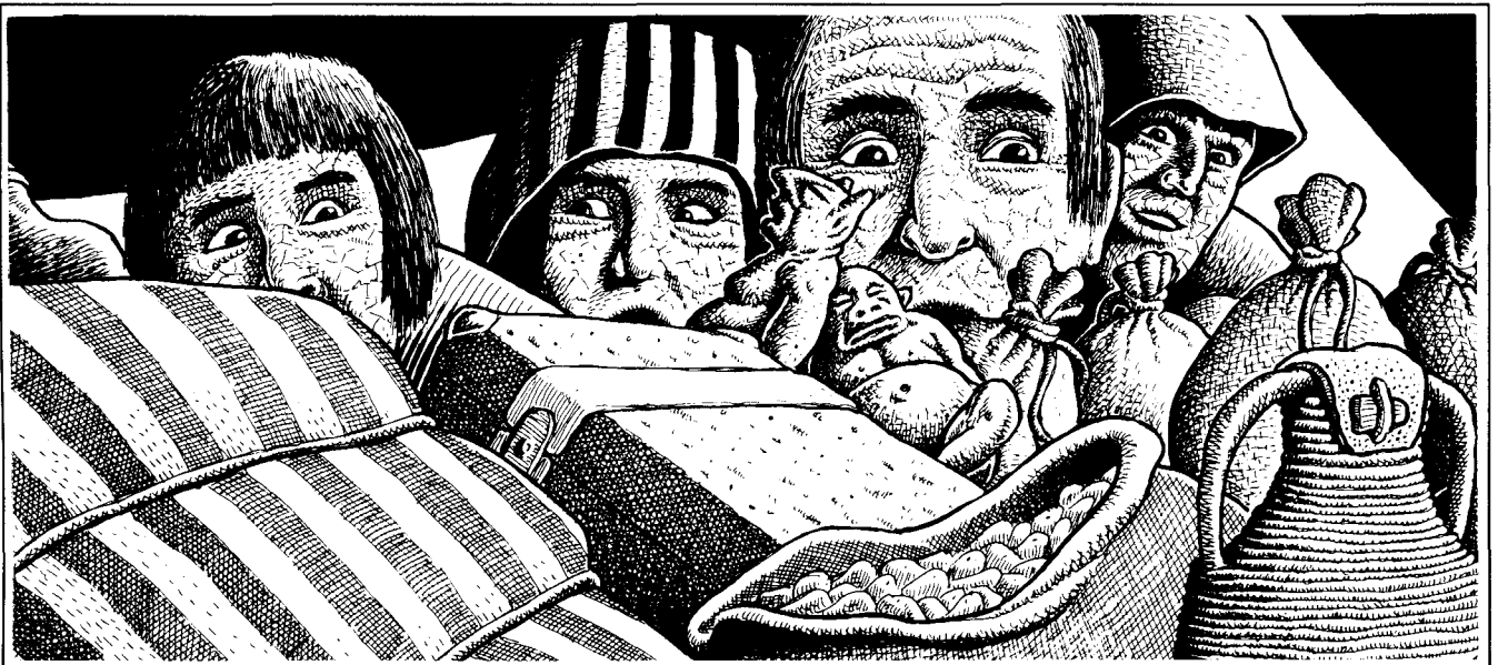
The lepers were excited to find food and many valuables left by the Syrian soldiers.