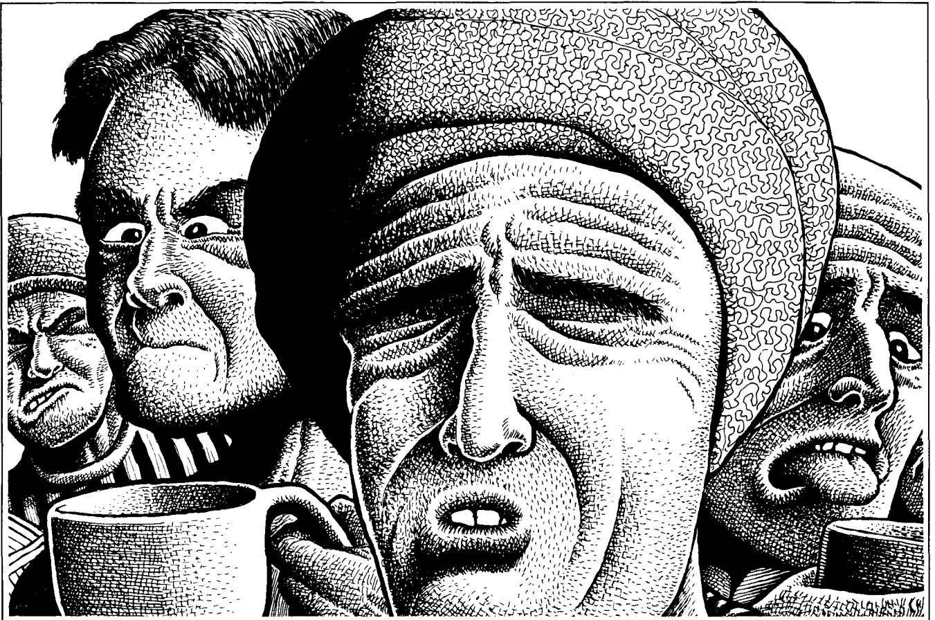
The men suddenly realized that the vegetable stew was poisoned.