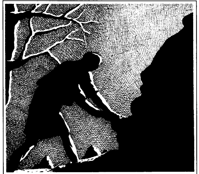
Gehazi quickly hid the money and clothing he had received from Naaman.

Gehazi was horrified. In a few seconds his skin became white with