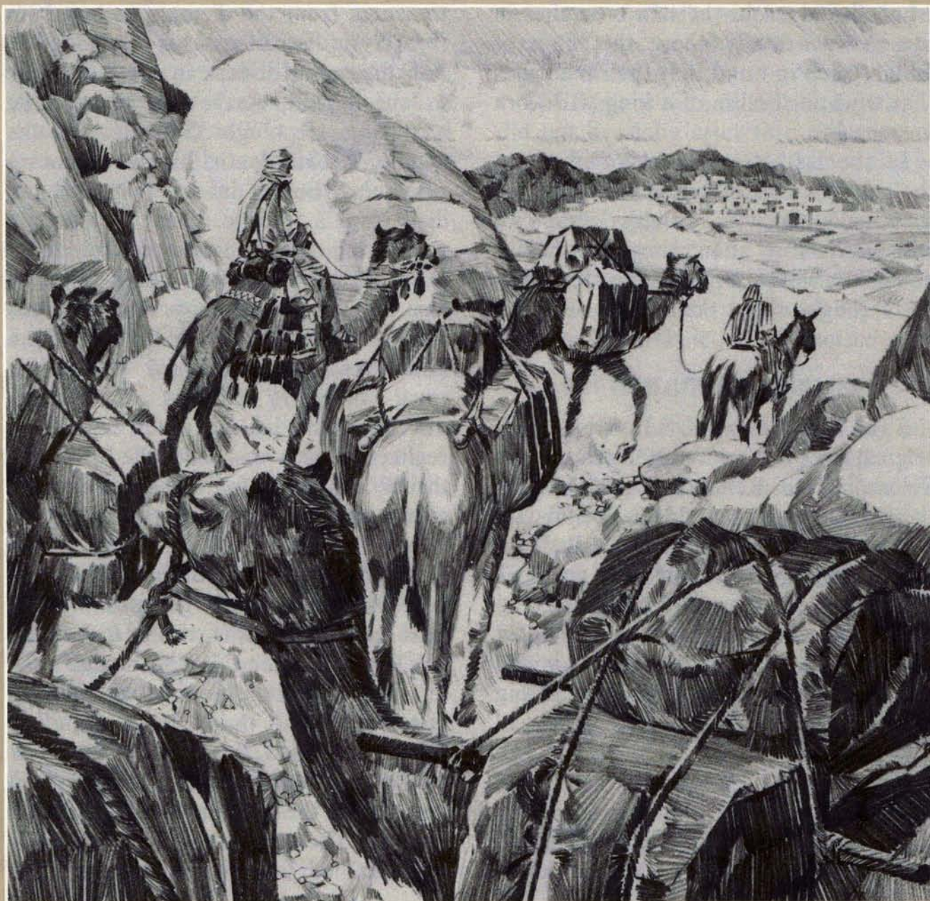
Judah's Decline as a Nation