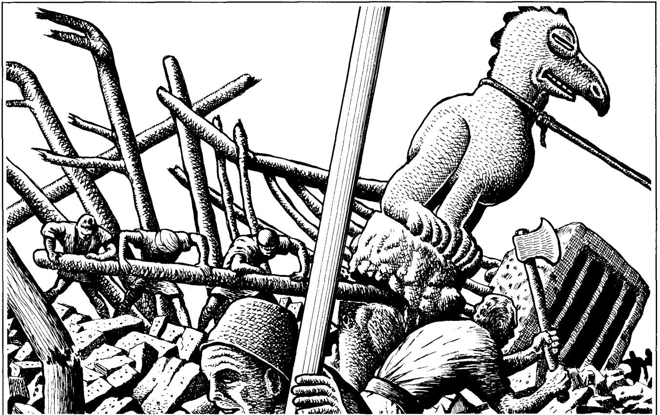
King Asa commanded that false religion be destroyed from the land!

King Zerah of Ethiopia (a country near Judah) saw how prosperous Judah was and began to covet the wealth of the land. So he marched his huge army toward Jerusalem.