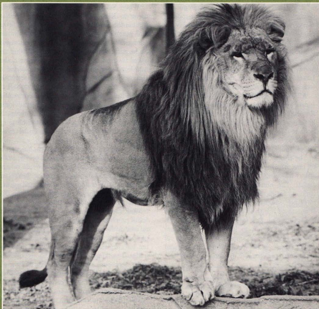
The Kings of Judah