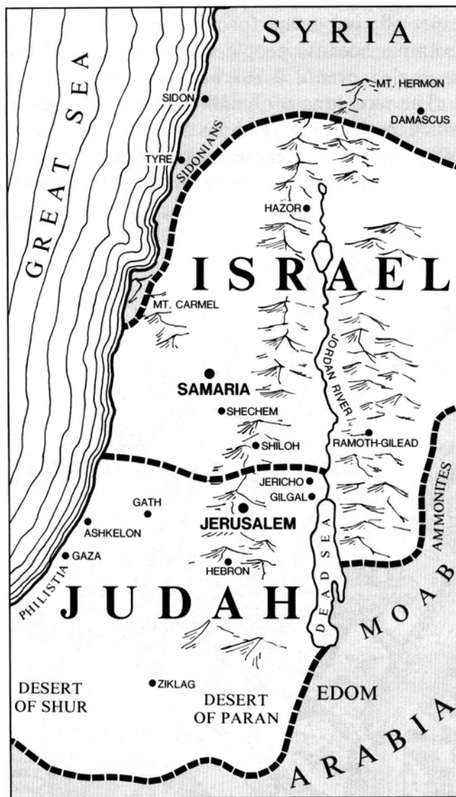
The Kingdom of Israel became divided into the houses of Israel and Judah.