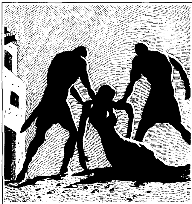
Murderous, self-professed Queen Athaliah dies at the hands of her subjects.

Joash’s early training was good for Judah.