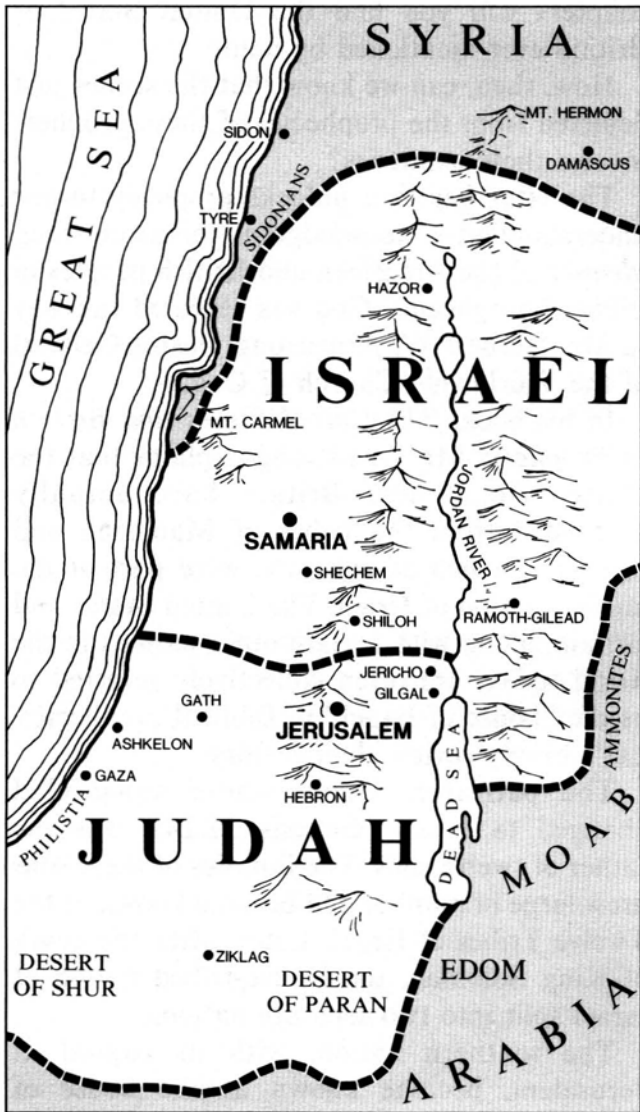
After the death of Solomon, ancient Israel became divided into the houses of Israel and Judah.

“For the children of Israel walked in all the sins of Jeroboam which he did; they departed not from them; Until the LORD removed Israel out of his sight, as he had said by all his servants the prophets. ”