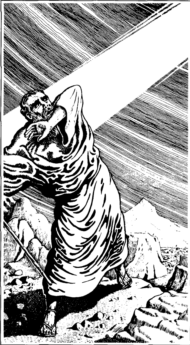
God fulfilled His promises to obedient Abraham by greatly blessing his modern-day descendants.

bestowed (Genesis 48). And as a careful study of history shows, the modern-day descendants of Ephraim and Manasseh—formerly the leading tribes of the house of Israel—are Britain and the United States today.