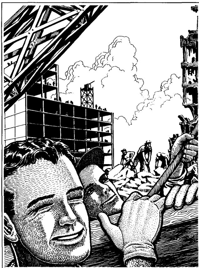
The devastated cities will be rebuilt after Jesus Christ returns to earth.

The gruesome sacrifice of Christ shows that