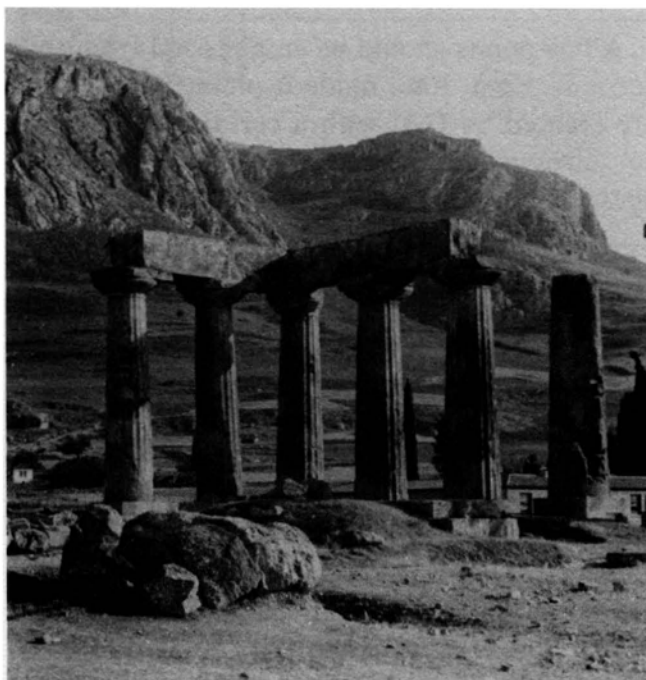
Ruins at Corinth in southern Greece today. Paul wrote the epistles of I and II Thessalonians during his 18-month stay in Corinth.

While in Corinth, Paul became acquainted with a zealous Jewish couple who had served in the New Testament Church for many years.