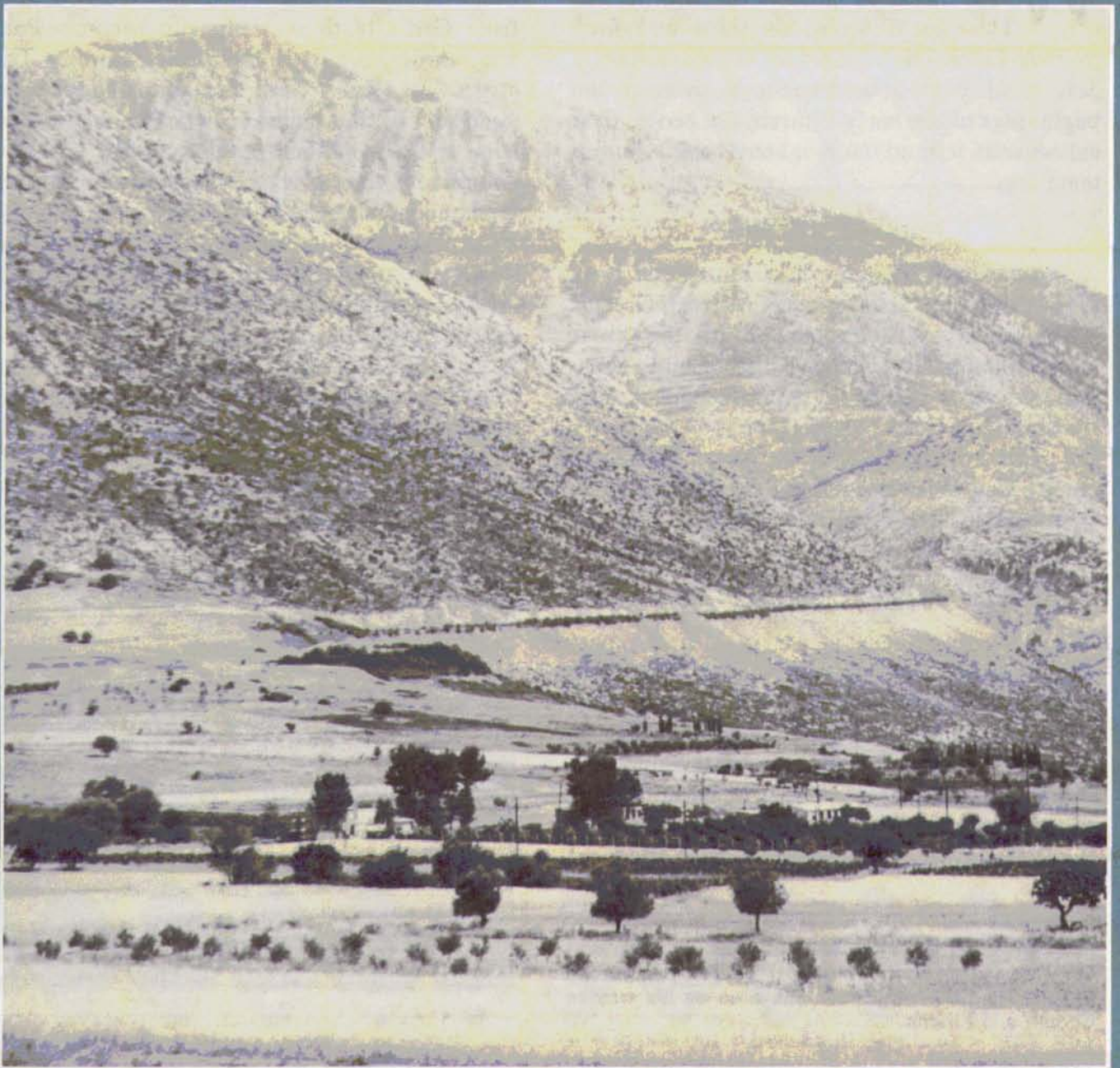
The Life of Paul — Part 3