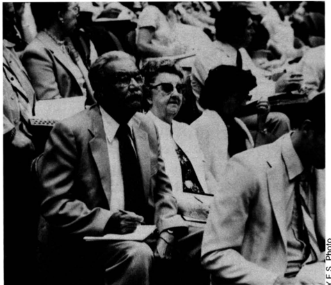
Sabbath-keeping is a special sign between God and His People.

Under the leadership of Ezra and Nehemiah,