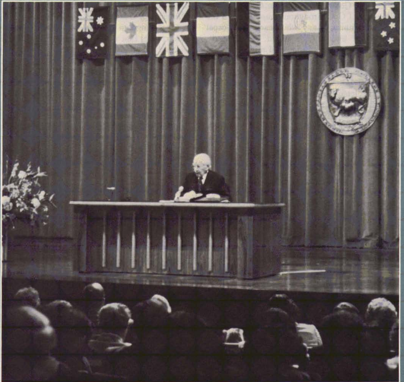
Fundamental Doctrines of God's Church