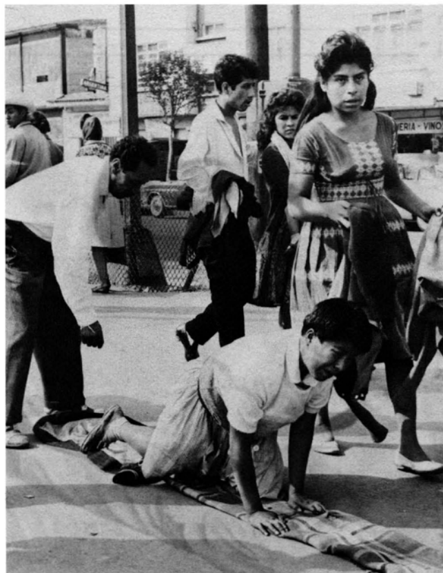
No amount of penance or human works can bring about God’s forgiveness of sin.

True repentance is not a temporary sorrow for sin. It is something much deeper. Godly repentance is a permanent change in the way