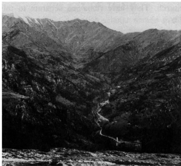
The Angrogna Valley in the Cottian Alps. It was in this area that the latter part of the Thyatira stage of God's Church was headquartered.

An event took place which totally changed Peter Waldo's life. It was the death of his close friend, which caused him to seriously consider the meaning of life.